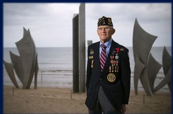
WORLD WAR II