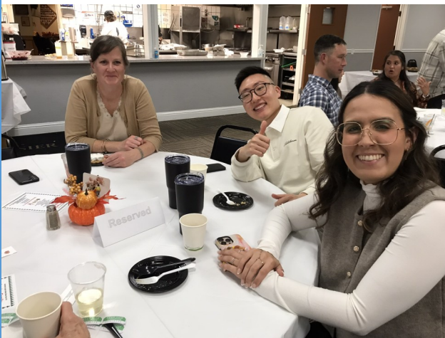
63rd RD & DCMA Space Enterprise (AF)