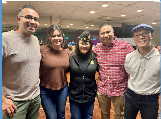
129th ANG Rescue Wing

Thank you , Post 419 members, for supporting our thank you dinner!