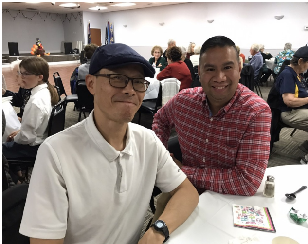
129th ANG Rescue Wing