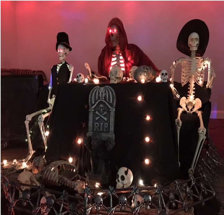
The Halloween Party - Folks dressed up in their scariest costumes. A HOT band played all the latest fiery tunes. A spooky time was had by all.