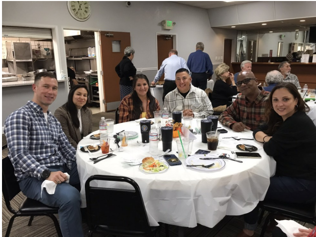
San Jose MEPS at Moffett Field