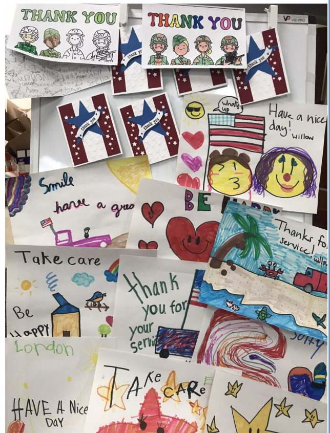
Local Elementary School children sent us Thank you cards and pictures