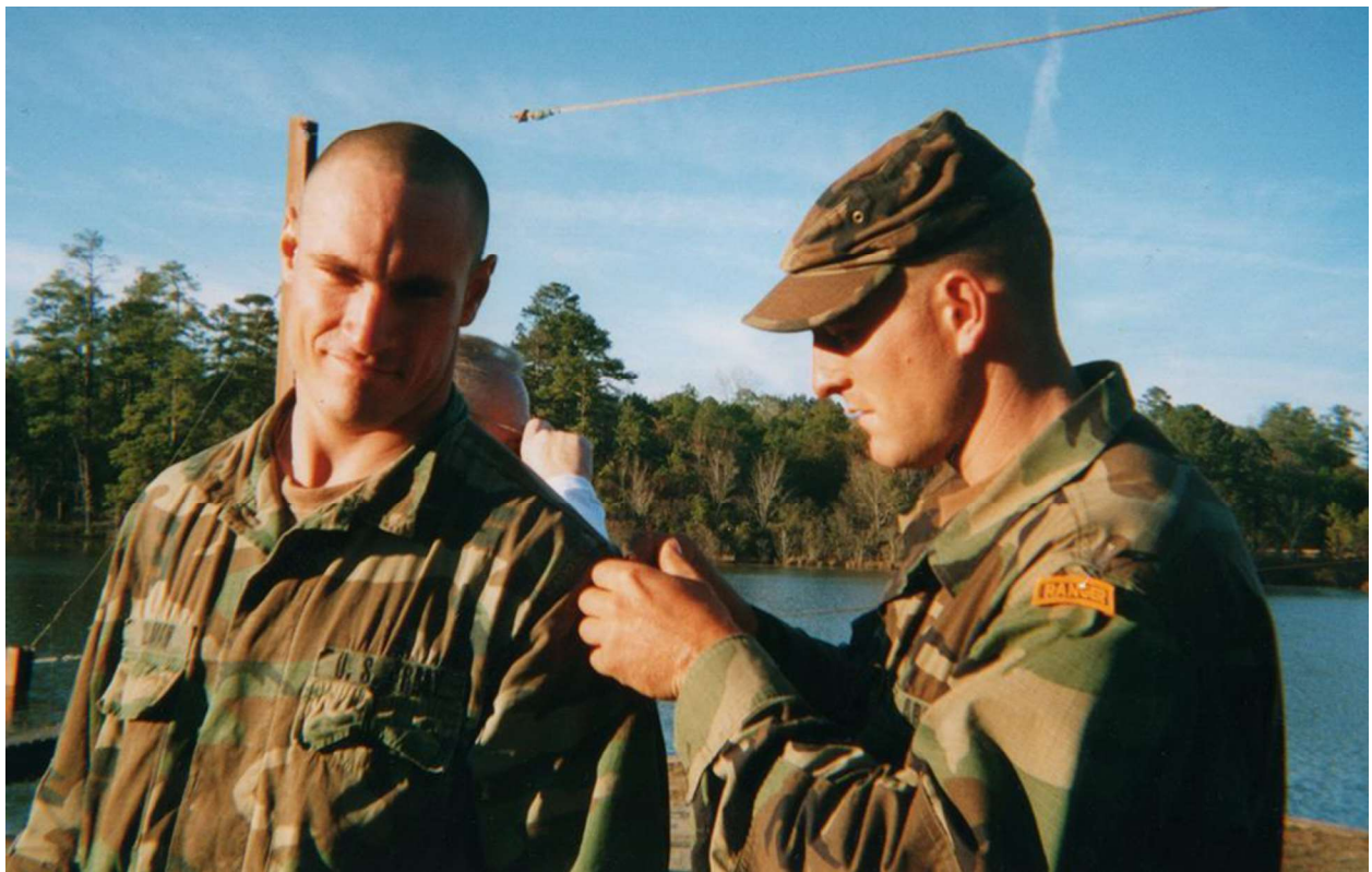
The day after the attacks of September 11, 2001, Pat told a reporter, “At times like this you stop and think about just how good we have it, what kind of system we live in, and the