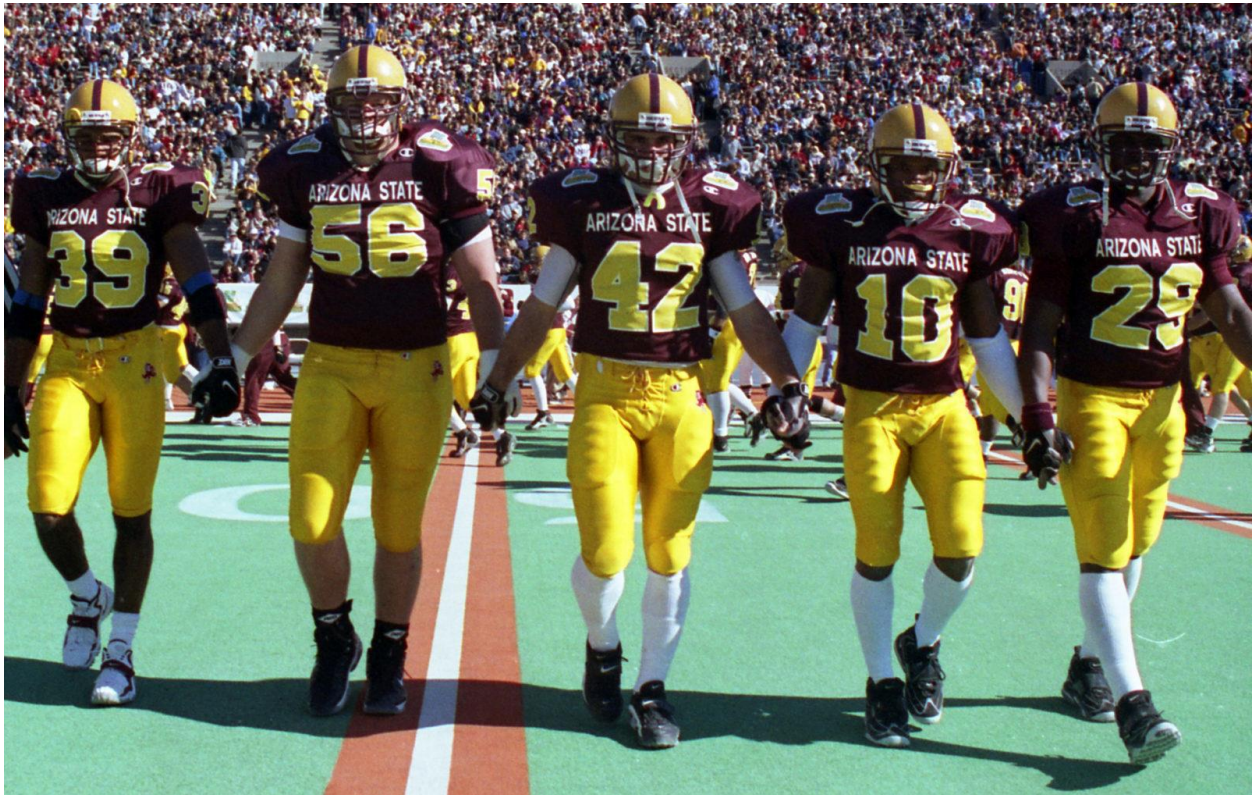
Arizona State University recognized Pat's potential both in classroom and on field with a scholarship to play for the Sun Devils. What Pat lacked in physical size he more than made up for in intensity as linebacker. He led ASU to the 1997 Rose